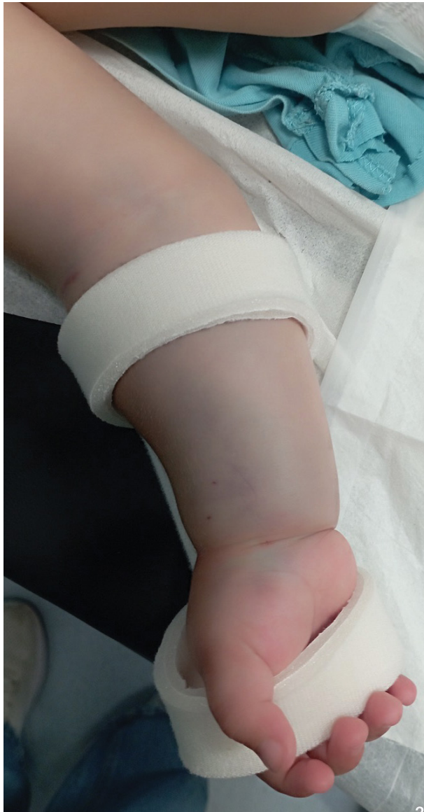
Figure 3: Bite marks on the volar part of the wrist and local edema and ecchymosis of the child who did not require fasciotomy

PICU for two days, where antivenom serum was given. Serial hourly neurovascular examinations demonstrated improvement of the limb's status, and no surgical intervention was necessary. After antivenom serum administration and slight limb elevation the swelling progression came to a halt and gradually subsided. She was discharged from the PICU two days later and stayed for monitoring in the pediatric clinic for five more days until final discharge. There were no systemic or local