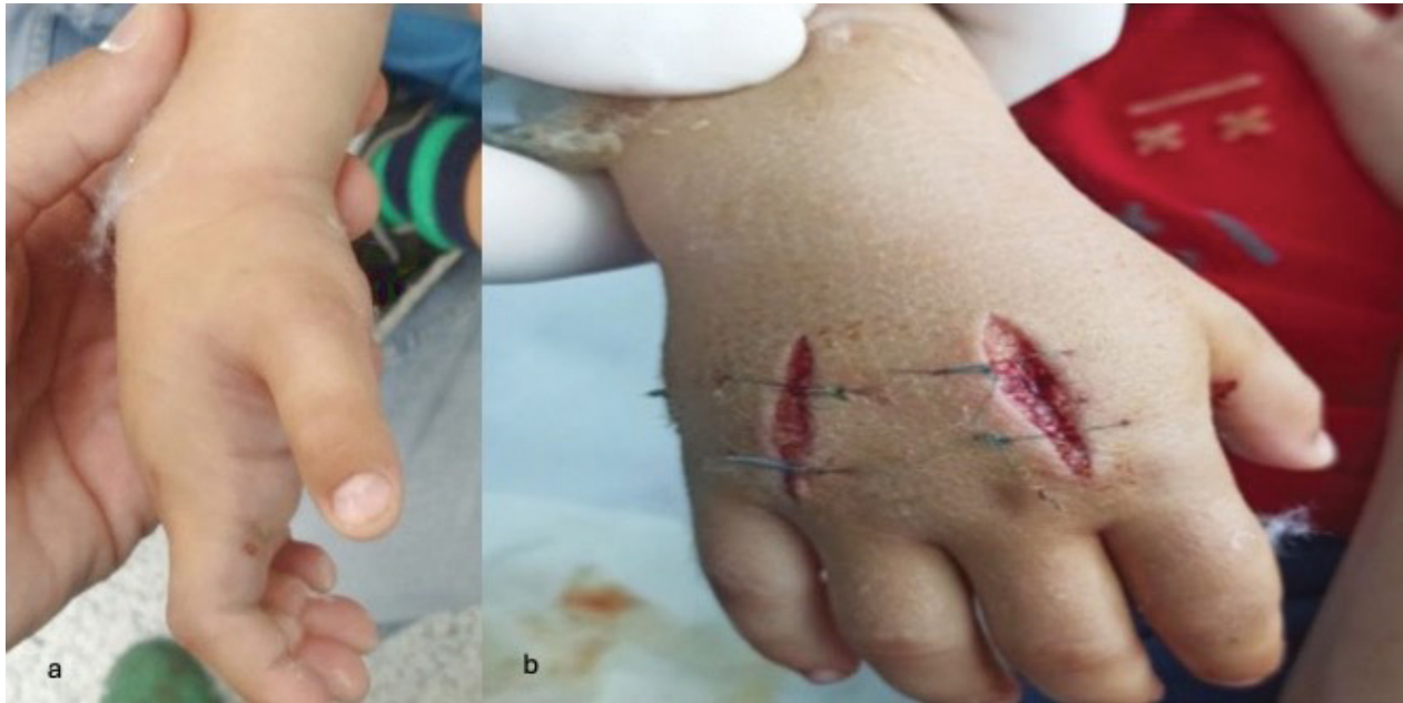
Figure 1: a. Distinctive bite marks in the right index and excess swelling of the hand before compartment release, b. Dorsal fasciotomies of the hand over the second and fourth metacarpals for the release of the interosseous hand compartments

ly stable, the affected arm was immobilized with a non-constricting splint, and there were distinctive bite marks on the dorsum of his hand. The hand was painful, bruised, and swollen. He was started on IV fluids and electrolytes, antibiotics, received tetanus prophylaxis, and was transferred to the PICU. There, he received antivenom serum under close monitoring without any adverse events. Serial clinical examinations demonstrated deterioration of the limb's neurovascular status, with increased swelling and ecchymosis of the right hand up to the forearm and humerus, and the patient developed paresthesia in the median nerve distribution. Emergency fasciotomies were performed 8 hours after presentation. The decision was based on clinical signs of paresthesia in the median nerve distribution, excess edema, extreme tension, and pain in passive muscle stretching.